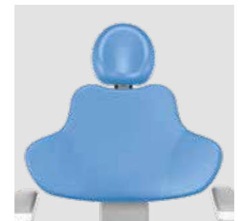
Nordic backrest This option ensures lasting comfort during protracted treatment sessions and is shaped to aid dentists who work in 'indirect vision' mode.