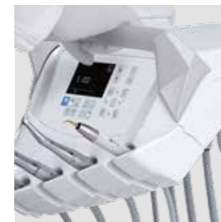
Removable handle A broad handle running the full width of the module makes module movement even easier. The handle can be removed for cleaning purposes.

A control panel with a large, easy-to-read display is positioned above the instruments. Dentists can control patient chair movements, hygiene systems and other integrated devices. For example, the optional LCD touch screen provides the dentist with a full complement of endodontic functions, including control of the apex locator with data display during canal treatment.