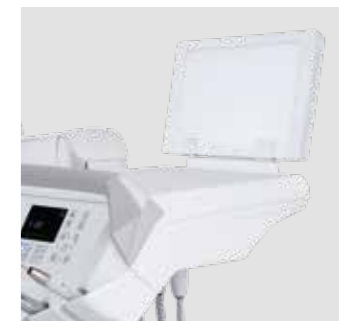
X-ray viewer The optional backlit X-ray viewer can be used to display all X-ray images, including panoramic ones.