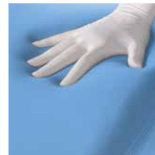
Memory Foam Exceptional comfort and proper anatomical support thanks to special upholstery options.

and has a lift capacity of 190 kg. Shaped to let dental staff move closer to the patient during treatment, the backrest is suitable for adults, children and any treatment type.