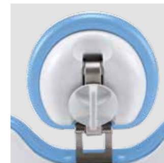
Universal headrest Supplied as standard, the headrest rotates on two axes and can be positioned for adults and children alike.