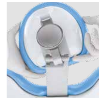
Atlaxis headrest The headrest that follows the patient's anatomy. Ultra-simple fingertip release of the pneumatic lock allows orbital movement to achieve perfect positioning, vertical adjustment included.