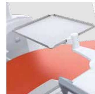
Tray holder Large transthoracic tray holder mounted on the International module.