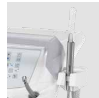
Sixth instrument The international dentist's module can be completed with an optional sixth instrument: camera or T-LED light.